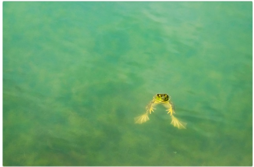
Best of Show: Judy Cox